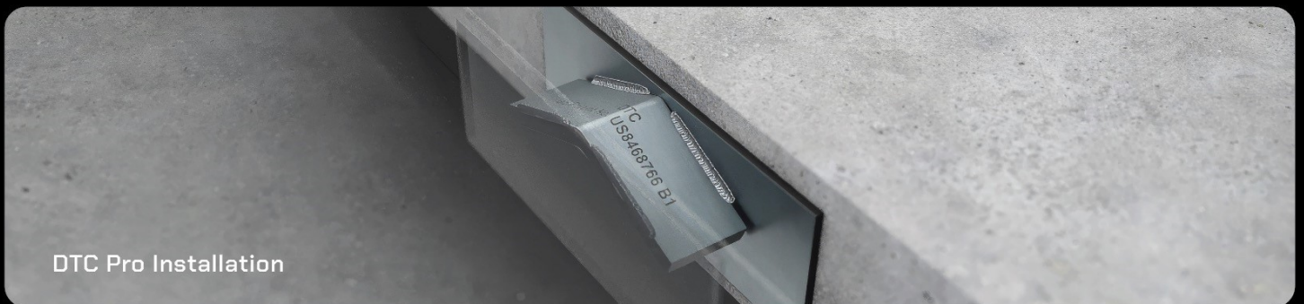
DTC Pro Installation

The DTC Pro is a product of Northford Structural Connections, a privately held company.