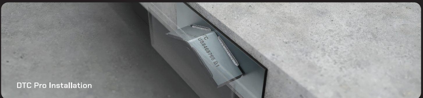
DTC Pro Installation

The DTC Pro is a product of Northford Structural Connections, a privately held company.